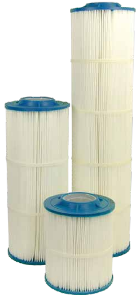
Premium Hurricane® Polyester Cartridges